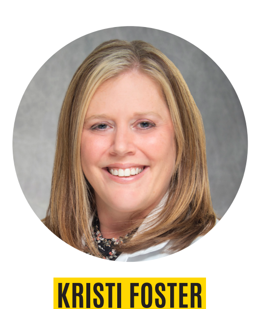
ADVANCED REGISTERED NURSE PRACTITIONER PEDIATRICS PROJECT FOCUS: