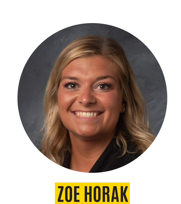
FELLOW UNIVERSITY OF IOWA PHYSICIANS PROJECT FOCUS: Offer providers a document that outlines