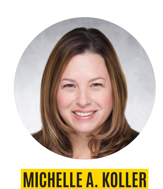
ASSISTANT MANAGER ORTHOPEDICS AND REHABILITATION PROJECT FOCUS: Create a workers compensation tool kit that can be applied to any clinical department.