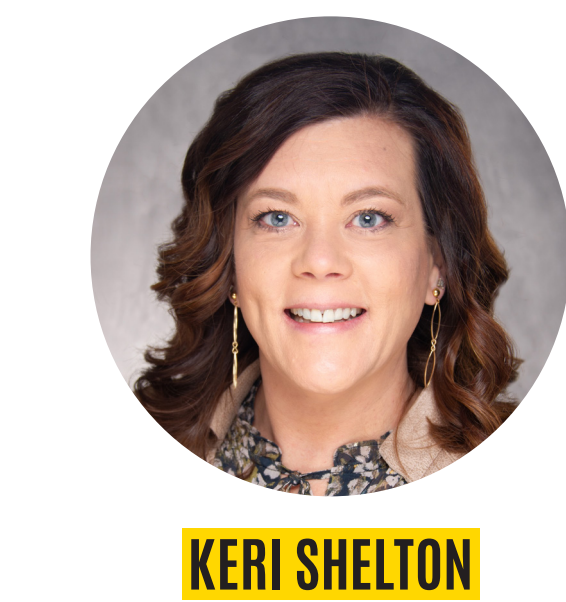
NURSING PROJECT FOCUS: Improve the ability to safely staff the pre- and postoperative anesthesia units throughout the perioperative division (Main Operating Room, Ambulatory Surgery Center, Stead Family Children's Hospital).