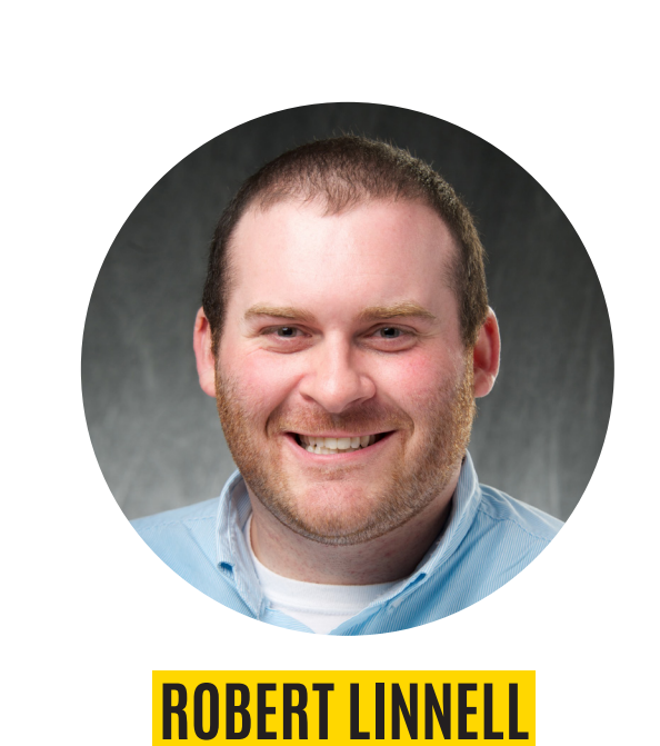
UI COMMUNITY CLINICS PROJECT FOCUS: Refine and expand the telemedicine platform and workflows and build a system for expanding to other departments within the UI Health Care.