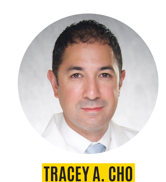
NEUROLOGY PROJECT FOCUS: Elevate the level of care, education, and research of the Neuroimmunology Division and our regional and national reputation.