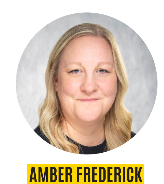
FOOD AND NUTRITION SERVICES PROJECT FOCUS: Improve the consumption rate of supplements offered to patients that are

malnourished or at risk of malnutrition.