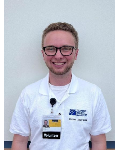
Cam Harvey Burn Treatment Center, Geriatric Psychiatry