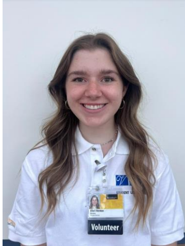
Elleri Herman Patients' & Children's Library, Radiology