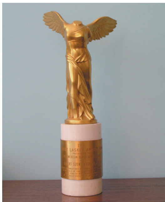
The Albert Lasker Award 1954 presented by the American Heart Association to Albert Szent-Györgyi.